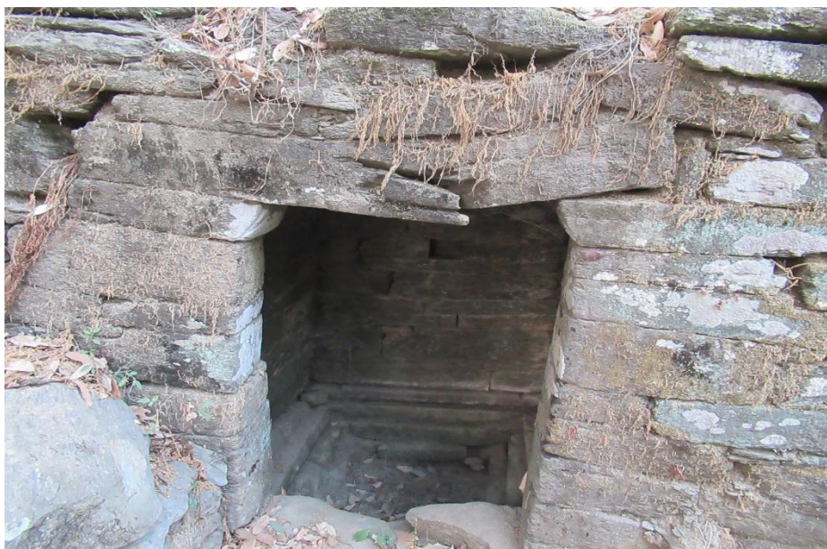
Photo: Drying of an ancient spring source in Ritha, Joroyal Rural Municipality, Doti District.