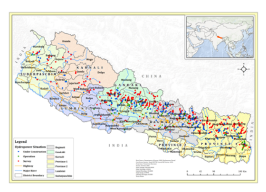
Figure 2: Location of hydropower construction in the rivers/rivulets (Data source-Department of Survey, 2020)