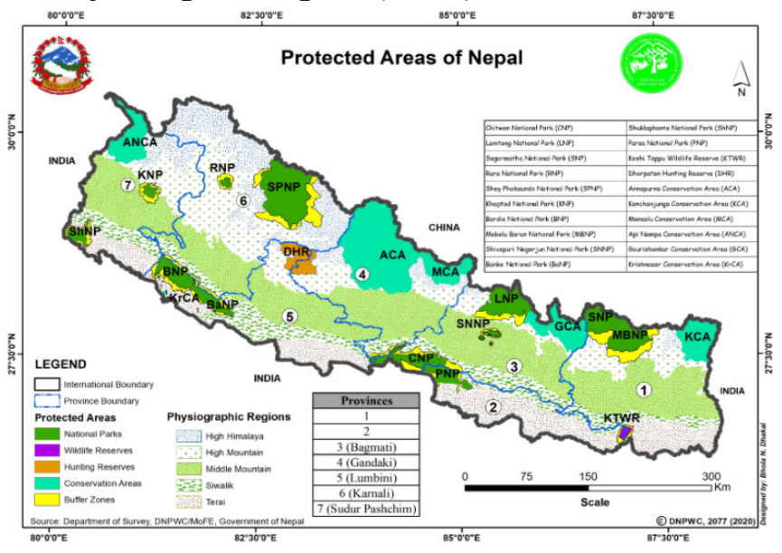
Figure 1: Map of protected areas of Nepal

Likewise, the history of wildlife conservation in Nepal began with the formulation of the National Park and Wildlife Conservation Act, and the establishment of Chitwan National Park in 1973. At present, protected areas cover 23.39 percent of Nepal's total area. The protected areas resemble 12 national parks, 1 wildlife reserve, 1 hunting reserve, 6 conservation areas and 13 buffer zones (Figure 1, Annex 1). Out of these protected areas, 10 protected areas (Chitwan NP, Shuklaphanta NP, Langtang NP, Rara NP, Bardia NP, Parsa NP, Sagarmatha NP and Shey-phoksundo NP, Koshi Tappu WR, and Annapurna CA) are conducting wetland management programs (DNPWC, 2019). However, the population growth and subsequent habitat destruction are exerting massive pressure on the habitat of flora and fauna in the protected areas. As a result, species are listed under threatened and critically endangered categories (table 3).